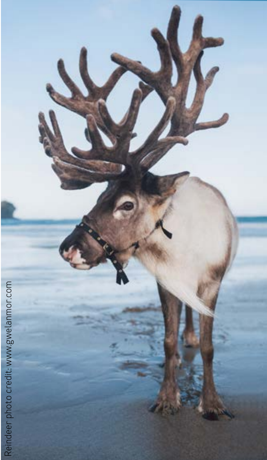
Reindeer photo credit: www.gwelanmor.com

Please visit our website for up-to-date information and a full calendar of events. www.stivesindecember.co.uk